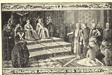
COLUMBUS ANNOUNCING HIS DISCOVERY